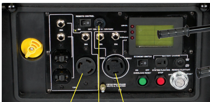
PH6500RI Control Panel

30 Amp 120V Outlet 120V/240V Switch 50 Amp 120V Twist Outlet